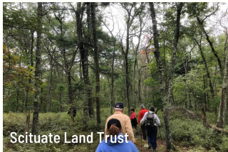
Scituate Land Trust