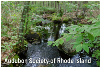
Audubon Society of Rhode Island

This year Aquidneck Land Trust, the Audubon Society of Rhode Island, Scituate Land Trust, and Westerly Land Trust all received funds from our Land Protection Grant Program in 2024.