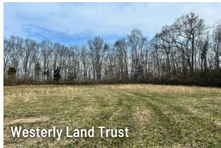
Westerly Land Trust